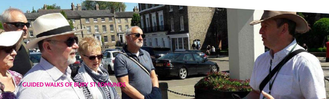
GUIDED WALKS OF BURY ST EDMUNDS

"Enjoy your visit to Bury even more with a guided walk"